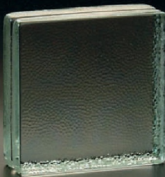
▶ 8" x 8" x 3" Stippled (Special Order)