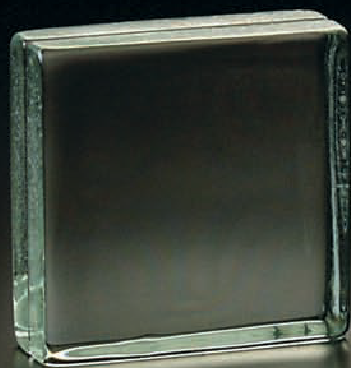
▶ 8" x 8" x 3"