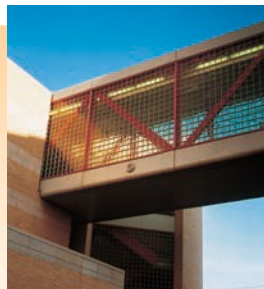
PERRY HIGH SCHOOL • PITTSBURGH, PA

“Students can be rough on a high school. So, when we built our gymnasium complex next to the existing building and connected the two with an elevated walkway, we used Vistabrik® solid glass block. The clear glass block lets in