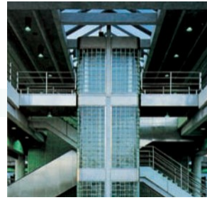
MIAMI ELEVATED RAPID TRANSIT SYSTEM MIAMI, FL