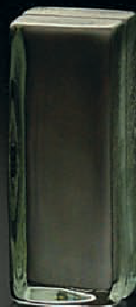
▶ 3" x 8" x 3" (Special Order)