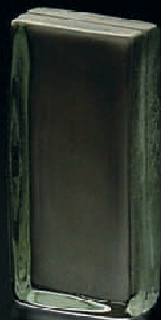
▶ 4" x 8" x 3"